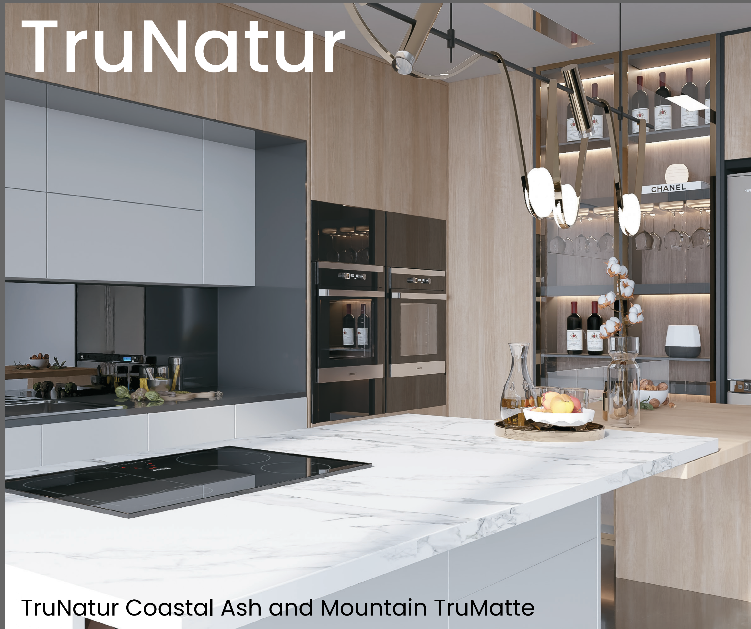
TruNatur Coastal Ash and Mountain TruMatte

TruNatur is a Premium Polymer Veneer faced panel that provides a high-performance alternative to natural veneer.